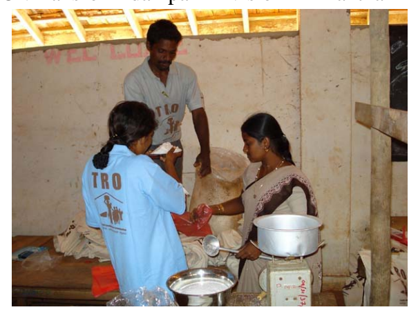
Civilians of Adampan Division in Manthai

West are displacing to safer areas themselves. TRO has made arranges through local NGO's to provide food, drinking water, dry food rations and transportation to the IDPs' choice where they are provided accommodation in Schools, Community buildings and friends & relatives houses.