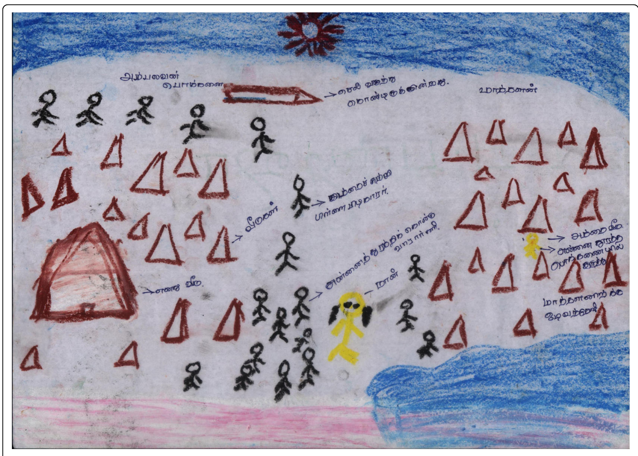
Figure 6 Caught in between . Drawing by Vanni IDP school student showing herself (in yellow) escaping from pillai piddikarar (LTTE recruiters in black) amidst shelling from the Sri Lanka army through huts towards (Pudu)mathalan beachfront area.

Despite having so many relations I am now all alone. My family, estate, health and relatives - I have lost them all, if only the shell that fell had hit me, we could have died together", he said with agony.