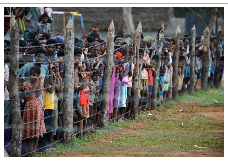
Figure 8 Internment Camps [111].

(CI) strategy appeared to have worked with people becoming more overt in their resistance to the LTTE, more open in criticism and defiance, at times breaking out into direct clashes [2,5]; finally escaping over to army control. Some narratives expressed gratitude to the state forces for having saved them from the LTTE. The state has continued to use this CI strategy to completely wean the Vanni people from the LTTE after the conflict by interning them in IDP camps with callous restrictions. They have sought to impose their version of the discourse in contrast to the ideas of liberation. Tamil homeland and separation. However, instead of using the historic opportunity for national reconciliation, the repressive ethnocentric approach without dealing with the underlying grievances in the long term will only alienate the minorities once again. Apart from the political implications, the contest of the different discourses at stake and the need of the Vanni IDP trauma for healing; if not social justice, the whole national reconciliation process at least needs some acknowledgement of what happened. If there is no healing of memories, merely a repression, the untreated collective trauma could well turn into resentment and rekindle cycles of violence once again.