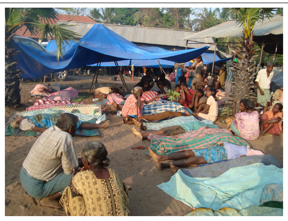
Figure 4 Ubiquitous death.

While running to Vadvahal we had to duck for cover in a palmyrah cluster by an open bunker. There were altogether ten children from my family and relations when a shell fell by the side killing our neighbor. The children were covered by sand. I was dazed thinking they