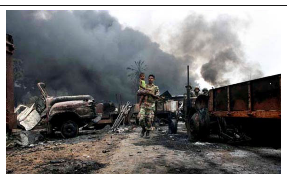
Figure 3 Apocalyptic Images [85].

Everyone ask us who survived that death land why we went behind them (LTTE)? Aren't you just ordinary civilians? From Killinochchi we were displaced to Vallipunam (Puthukudirrupu). We made a house there and stayed for a month. Shells that were falling kilometers away started falling in our yard. Seeing the dead and injured in neighboring houses our minds became disturbed and we joined those running to go where our legs took us. We changed places four to five times within a village. Wherever we went we dug bunkers like soldiers and brought together our kith and ken. We struggled to obtain food and water. It became quite clear that this war was against everything living in the Vanni. According to my reckoning there was one death for every 10 persons. Ordinary people were asked to go to Suthanthirapuram as it was made the safety zone. We found out what hell would be like there. When we saw people die