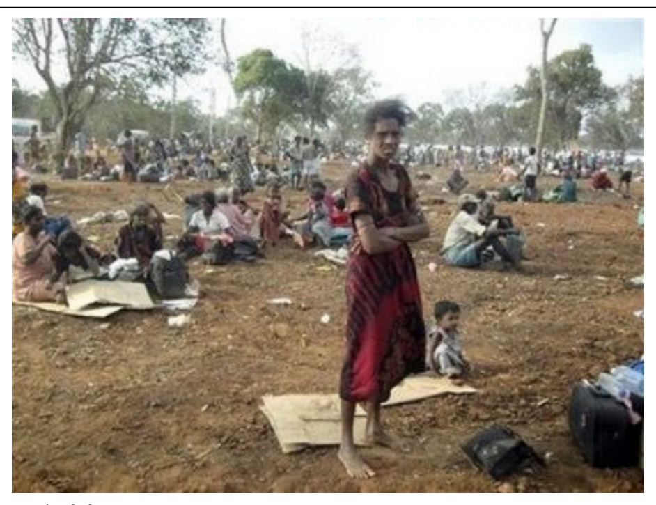
Figure 7 Utter Devastation [88].