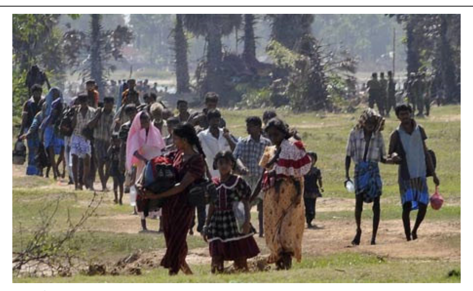
Figure 5 Treacherous Pathways [86].

The principal of the school had referred this IDP student with educational difficulties. She was found to respond poorly to questions or activities, be withdrawn, not mixing with other students, showing fear and