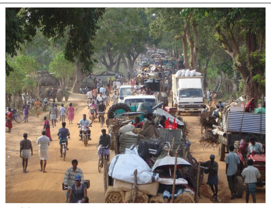
Figure 2 Displacements [79].