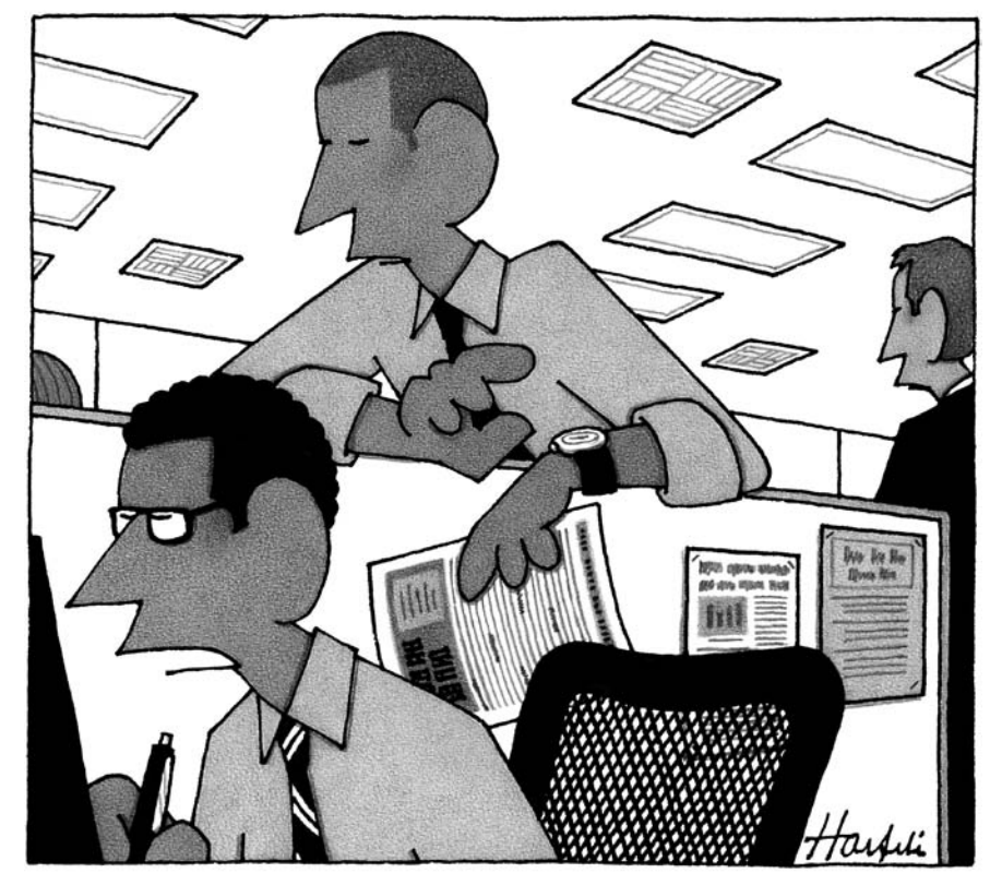
"The entrance to my cubicle is three feet away. Please respect my partition."

humous editorial, published four months before the Tigers were crushed at Mullaittivu, he wrote, "There is no gainsaying that [the Tigers] must be eradicated." But, he argued, a "military occupation of the country's north and east will require the Tamil people of those regions to live eternally as second-class citizens, deprived of all self-respect. Do not imagine you can placate them by showering 'development' and 'reconstruction' on them in the postwar era. The wounds of war will scar them forever, and you will have an even more bitter and hateful diaspora to contend with. A problem amenable to a political solution will thus become a festering wound that will yield strife for all eternity."