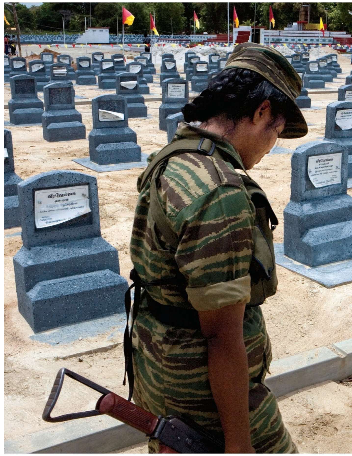
A female soldier of the Liberation Tigers of Tamil Eelam walks through an L.T.T.E. cemetery in Kilinochchi, in September, 2007.