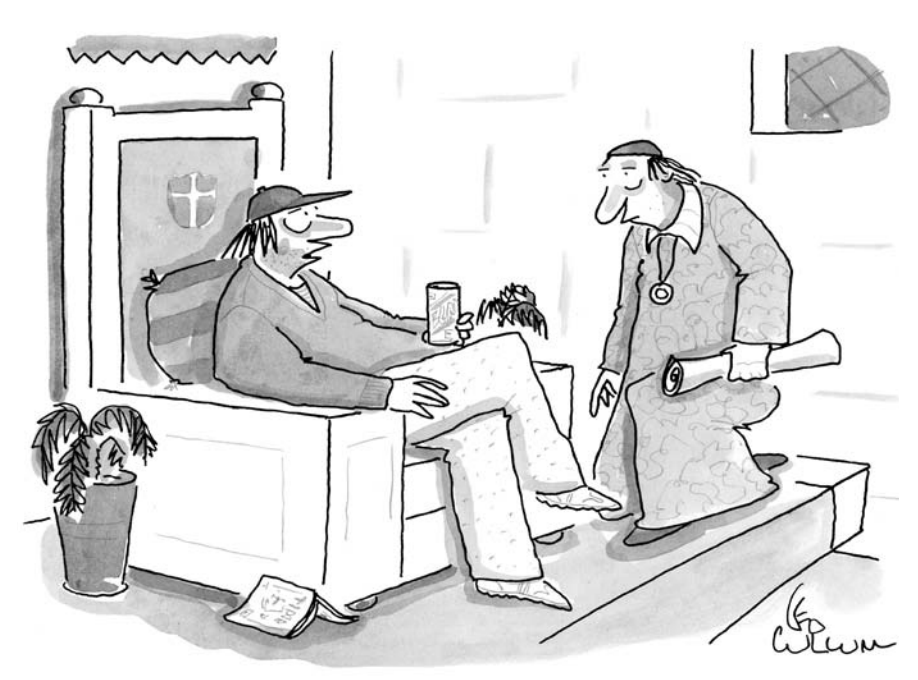
"I try to be royal without being regal."

Under the British, tensions festered between the Sinhalese, who make up seventy-five per cent of the population,