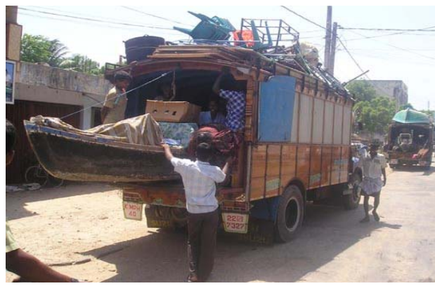
People moving belongings