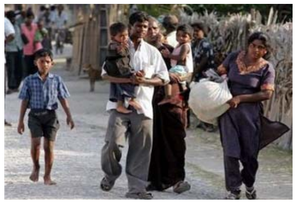
A family leaving Allaipiddy