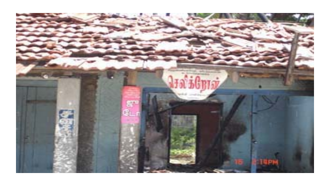
Communication centre damaged by Navy