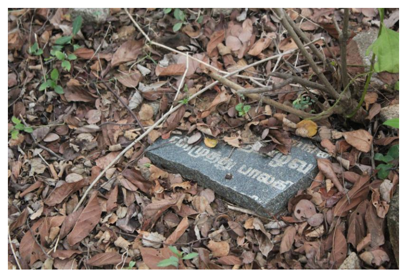
Remains at Aalangkulam Thuyilum Illam, Muttur East, Trincomalee (PEARL, July 2016)