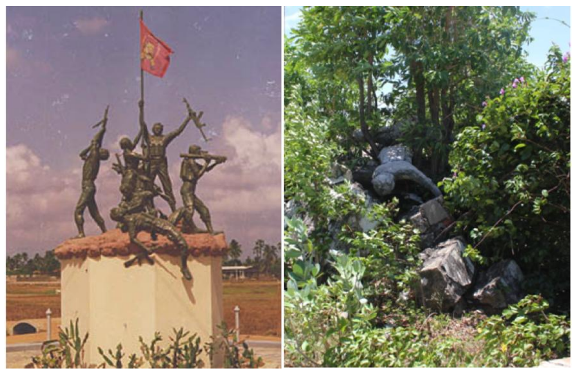
Monument to LTTE fighters in Thiruvil, Valvettithurai and its remains. It was destroyed in 2010 (Left file photo, Right PEARL, August 2016)