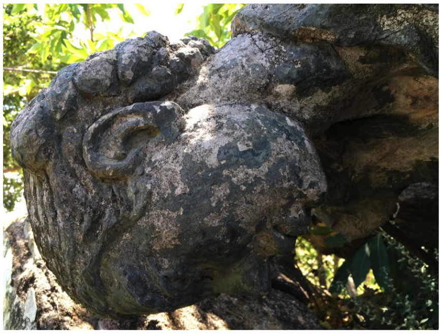
Remains of a destroyed LTTE monument in Valvettithurai, Jaffna (PEARL, July 2016)