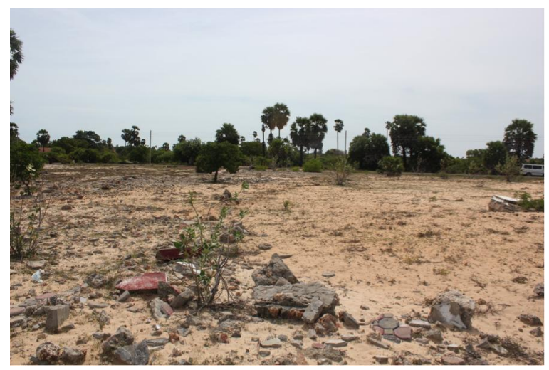
Remains of Uduththurai Thuyilum Illam, Jaffna (PEARL, July 2016)