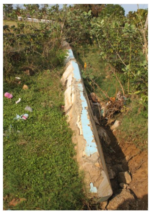
Monument to 12 LTTE combatants in Theeruvil, Valvettithurai - constructed in the early 90s and destroyed in 2010