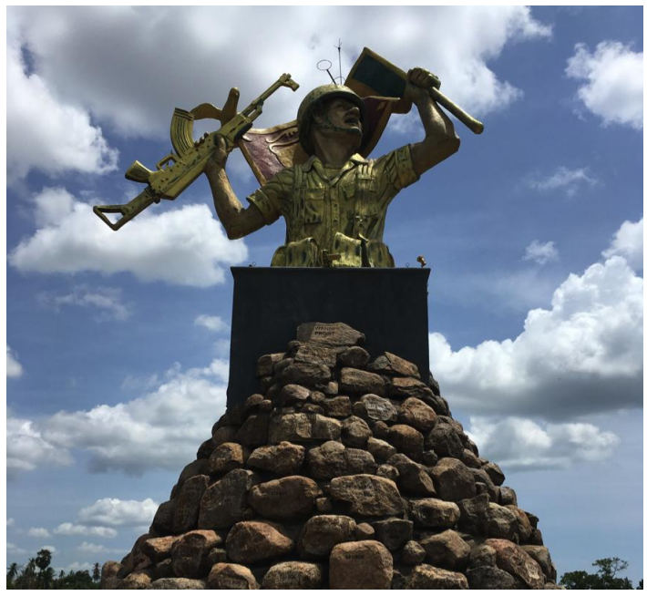
Sri Lankan victory monument near Puthukkudiyiruppu

For many in the victim community, the monuments feel like calculated reminders of their subjugation. Said one respondent: "they are deliberately placed on the main roads so we have to go past them" (Mullaithivu). The choice to construct the most prominent military monuments in the Tamil heartland of the Vanni, including in Kilinochchi and Mullaithivu, is perceived as intentional and offensive triumphalism. Interviewees were quick to point out that victory monuments are not as common in the Sinhala south as they are in the North-East.