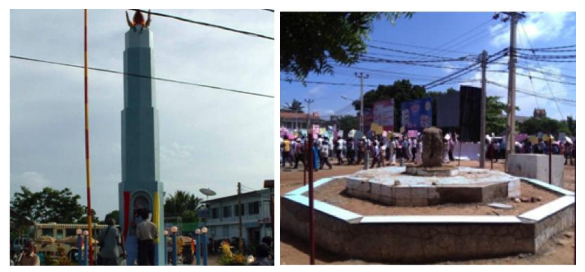
Lt Col Thileepan monument after it was rebuilt during the ceasefire and how it looks now after its subsequent destruction - September 2016