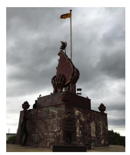
Sri Lankan victory monument at Elephant Pass, Kilinochchi (PEARL, July 2016)

of the war. They highlighted the war tourism industry, decrying the fact that "Sinhala tourists are coming to gawk" at places viewed as hallowed ground by the local population ( Kilinochchi ).<sup>33</sup> Some of the sites even house gift shops, with souvenirs for sale. Beside the toppled water tower at Kilinochchi sits a small store selling coffee mugs, books, and DVDs in Sinhala and English, and t-shirts with "Re-Awakening Kilinochchi" emblazoned across them. The complete absence of the Tamil language makes clear who the intended customers are.