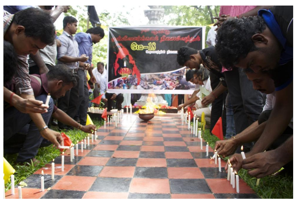
Mullivaikkal remembrance at Jaffna University, (May 2016,)

community are still afraid to commemorate openly. Several respondents mentioned fears that attending May 18 events would lead to visits from the CID. Others emphasized that the change in government might be temporary and any activities now may be punished at a later time. This fear stems from concern that history will repeat itself. During the last ceasefire (2002-2008), Tamil politicians, activists and journalists felt relatively safe to publicly raise human rights issues and advocate for political rights. However, as the ceasefire broke down, hundreds of those Tamils were targeted and killed by security forces. This has caused many respondents to view the current opening of political space with cynicism. As one interviewee explained: "People are afraid that the situation will deteriorate - anything they do now may come back to haunt them" (Trincomalee).