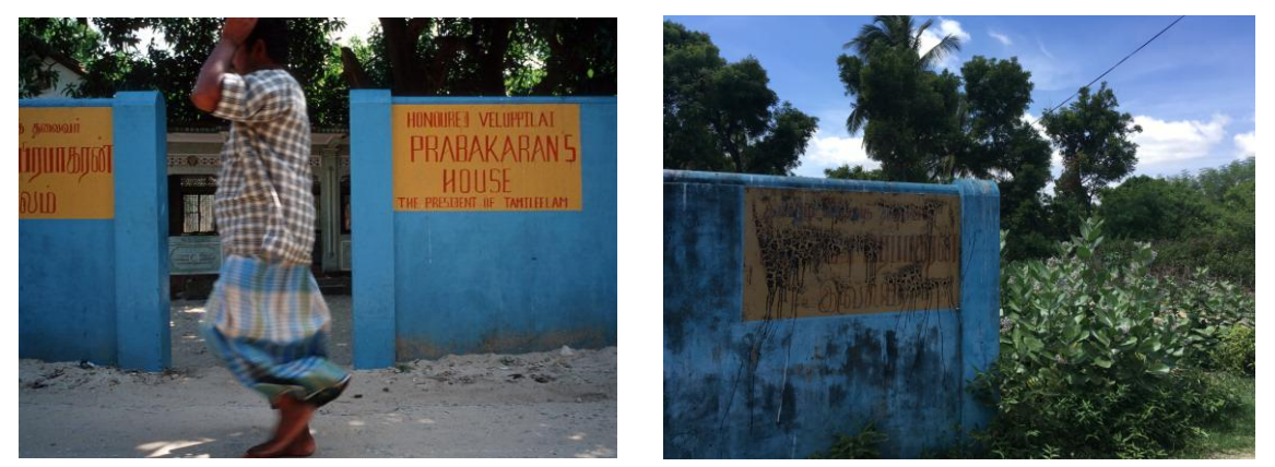
Prabhakaran's house during the ceasefire and after it was destroyed