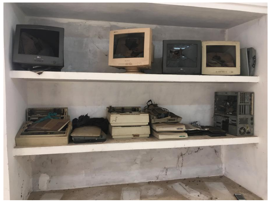
The Uthayan was attacked many times throughout the conflict and has kept damaged equipment (PEARL, July 2016)

Tamil journalists have been targeted throughout the conflict. From 2004 till 2010 at least 48 journalists were killed across the island - 41 of whom were Tamil.<sup>14</sup> One of the few instances of open memorialization of violence against Tamil civilians is the small museum documenting attacks on the Uthayan newspaper in Jaffna; the most widely read Tamil paper in the North. The paper lost five of its employees in that time period and their officers have been attacked numerous times since its formation in 1985, targeted by the Sri Lankan state, Tamil paramilitaries and the Indian Peace Keeping Forces. The owners have preserved damaged equipment and bullet holes in the walls in order to remember the many attacks. Photos of slain journalists adorn the wall. International high level officials have made a visit to the Uthayan one of the compulsory stops during their visits to Jaffna, including former British Prime Minister David Cameron and US Ambassador to the UN Samantha Power.<sup>15</sup> <sup>16</sup>