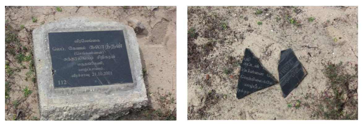
Remains of headstones in Uduththurai Thuyilum Illam, Jaffna (PEARL, July 2016)

Today, not a single Thuyilum Illam is left standing. Some have been abandoned to the encroaching wilderness. Others, including Kopay<sup>31</sup> and Ellaankulam, are now the sites of military camps, making them completely inaccessible to the locals. And, as one interviewee pointed out, the desecration of the cemeteries is compounded by the fact that rubble from the graves has been used to construct the roads leading to some of these military camps.