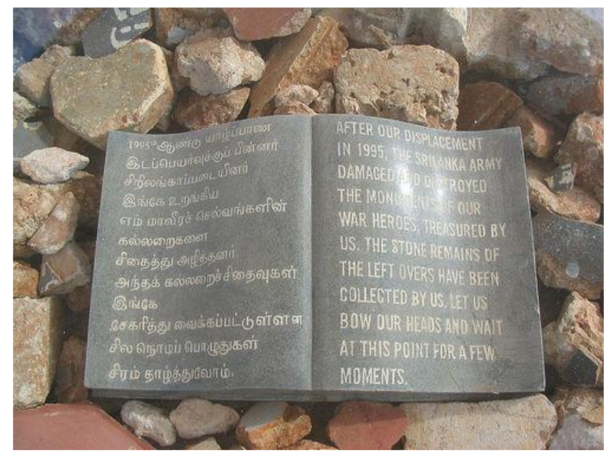
Remains of a destroyed LTTE cemetery were built into a monument - only to be destroyed again - Kopay, Jaffna (Tamil Nation)