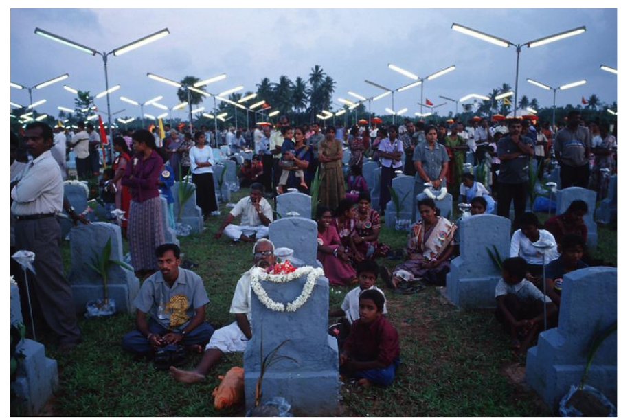
A Thuyilum Illam during Maaveerar Naal in the Northern Province

For ex-combatants and relatives of fallen fighters, honoring lost comrades and loved ones amounted to a duty they wanted to perform. As one interviewee explained: "It was our children and relatives who died in the LTTE. The struggle was just – we need to remember those who gave their lives for it, as we did before 2009" (Kilinochchi).