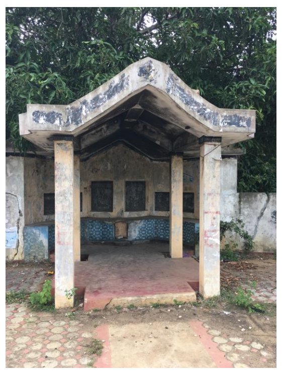
Photos of fallen LTTE fighters used to be displayed at this shrine-like structure - the writing has been covered with black paint, Valvettithurai, Jaffna (PEARL, July 2016)