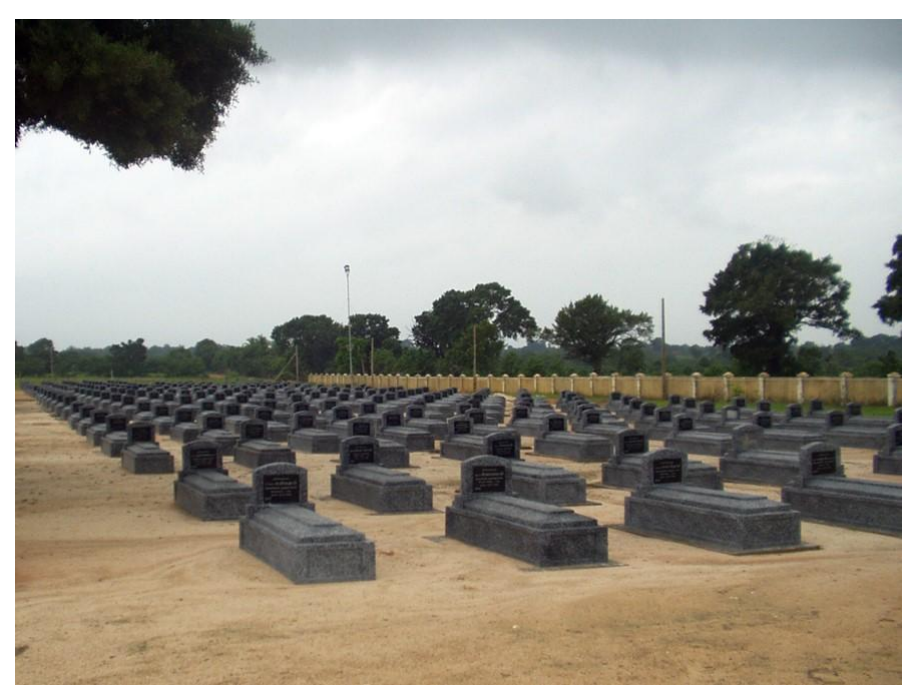
Thuyilum Illam, unknown location, before destruction