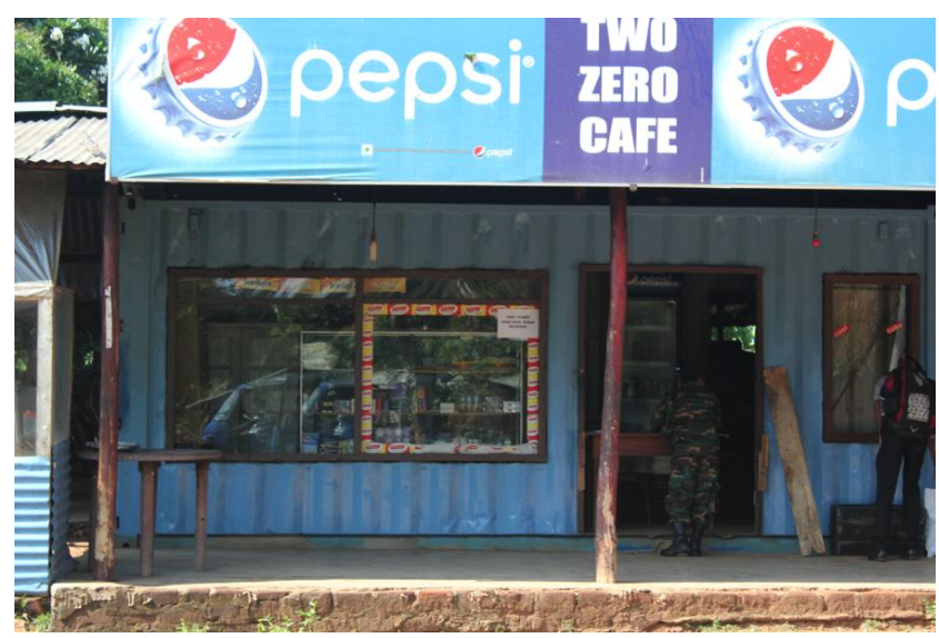
Military cafe in the Northern Province (PEARL, July 2016)

The military presence is not limited to the camps. PEARL's researchers observed barbershops, farms, small stores, and restaurants operated by uniformed soldiers. Many of these establishments had signs in Sinhala only.