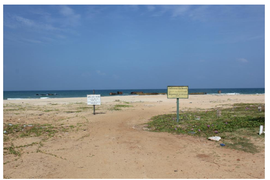
Mullivaikkal Beach

Respondents also identified a number of other massacres, listed in the chart below, as significant dates for memorialization. By far the most frequently mentioned event to commemorate was Black July, perhaps due in part to the fact that the anniversary of the pogroms occurred during the course of PEARL's research. And while a majority of the events raised were crimes committed against Tamil civilians by state forces, it is important to note that multiple respondents raised the issue of LTTE killings of both Tamil political and militant opponents and Muslim civilians. Said one interviewee, emphasizing the importance of remembering these events: "It's harder to deal with internal violence than the violence of the state" (Vavuniya) .