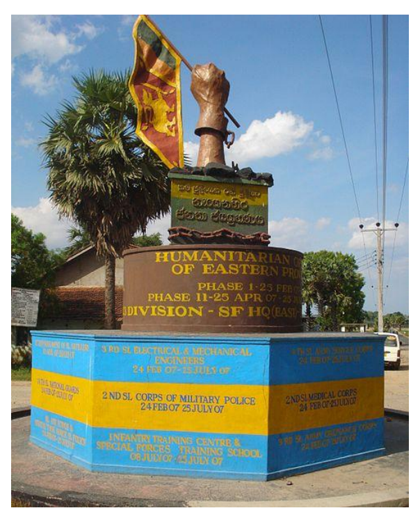
A monument commemorating the "humanitarian operation", Karadiyanaaru, Batticaloa (Unkown)