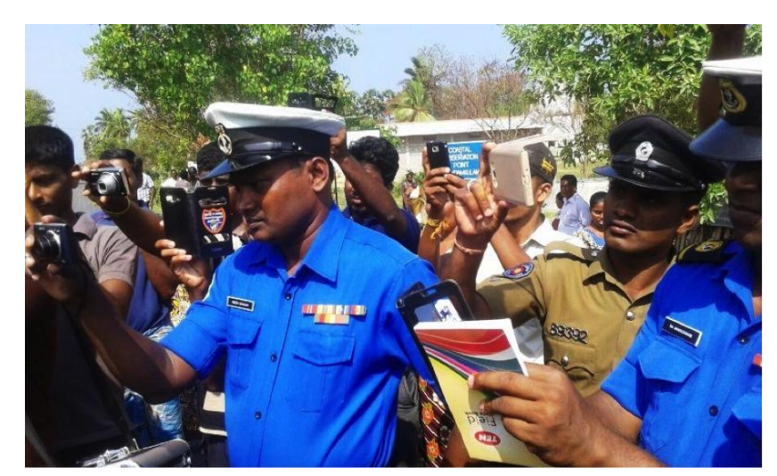
Police and Navy personnel recording protesters in Jaffna (PEARL, March 2016)

forcibly impose memory of trauma through the presence of the state's victory monuments. But many respondents raised an additional effect of the security forces' presence: constraints on passing on historical knowledge to the next generation. This is of particular concern, given that the educational system follows a national curriculum that teaches a Sinhala-centric version of history. As a schoolteacher clarified: "There is a difference between the Tamil and Sinhalese language syllabuses, until it comes to the subject of history, where it is the same. The distinct history of the Tamils is side-lined" (Kilinochchi). Many respondents said they were afraid to fill this gap at home, for fear that it would endanger their children. Echoing comments made by numerous interviewees, one explained: "We are afraid to talk to our children about what happened. We don't want to risk them talking about it at school or elsewhere. We may get into trouble with the military" (Batticaloa).