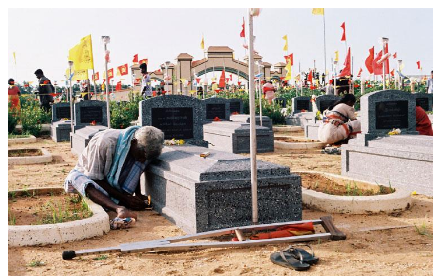
Aadkaaddiveli Thuyilum Illam, Mannar, before destruction