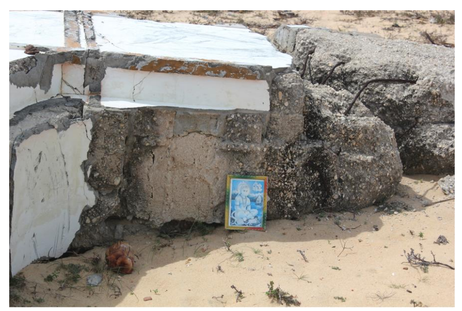
Religious icon at Uduththurai Thuyilum Illam, Jaffna (PEARL, July 2016)