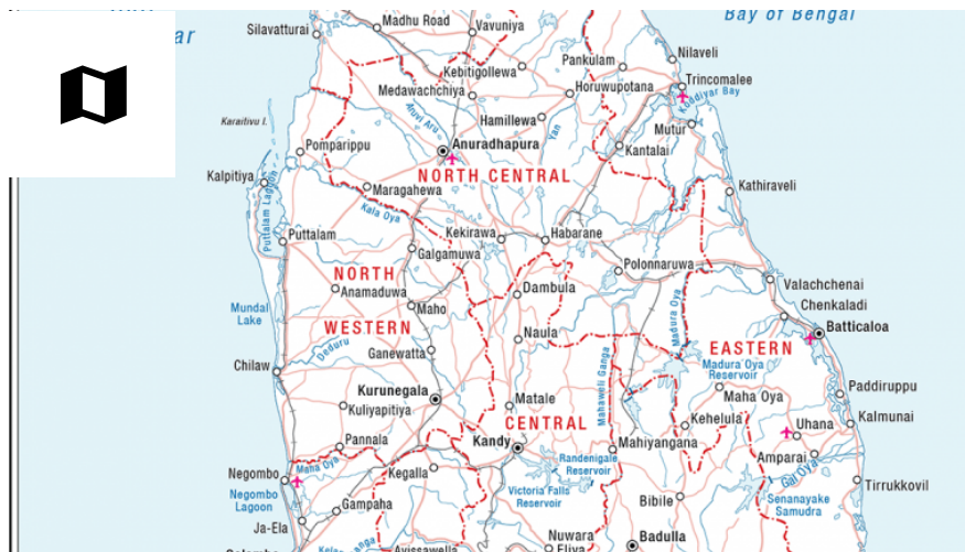
Map of Sri Lanka Crisis Group. Based on UN map No. 4172 Rev. 3 (March 2008)