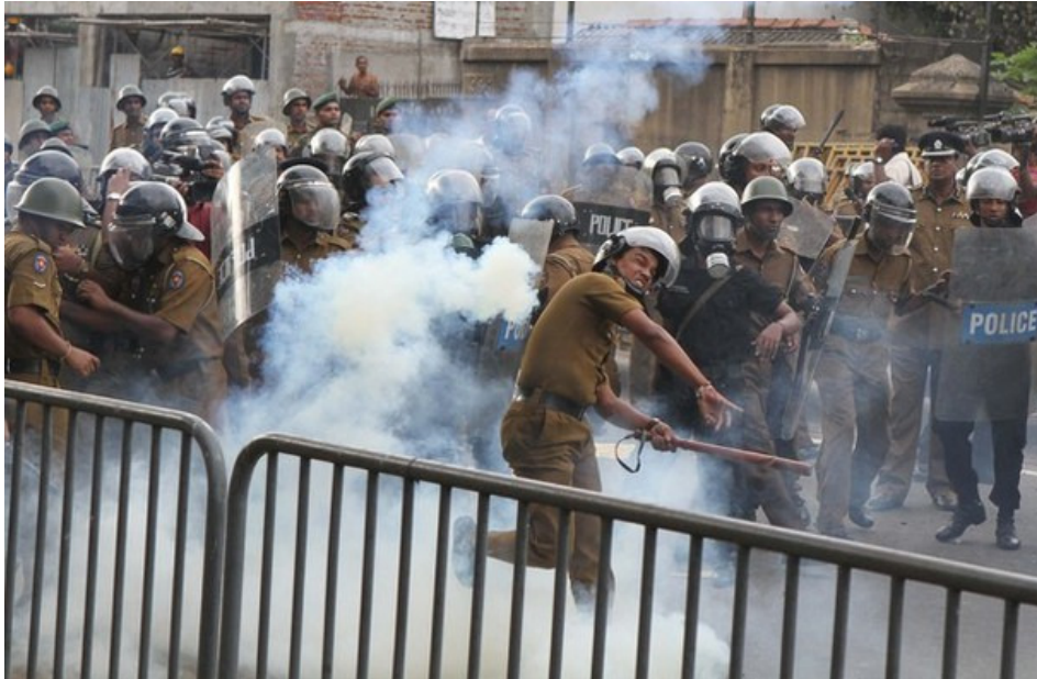
On 17 Feb 2012, a thousands strong opposition protest was disrupted and attacked by the police in Colombo.

On 10 Feb 2012 , as the Movement for People's Struggle (also known as People's Struggle Movement) was conducting a leaflet campaign in Colombo, armed security personnel had warned them not to engage in distribute anti-government activities and photographed them. 28