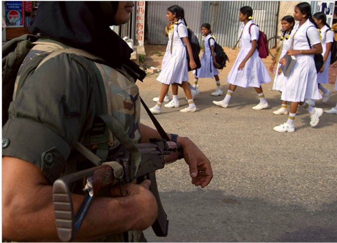
Militarization of the country — Jaffna

9. Surrendered currently in detention have been restricted in their access to counsel. Interviews with surrenderers about the process of surrendering to the military indicate that very few were informed of their legal rights, including the right to challenge their detention. Sri Lankan attorneys told us that families and attorneys are rarely notified of transfers within the prison system, causing many detainees to become “lost” for periods of time. Attorneys are not optimistic about the potential for successfully challenging arbitrary detention, as they are concerned that the courts are biased. Courts are also required to defer to the Executive branch on many decisions under the Prevention of Terrorism Act.