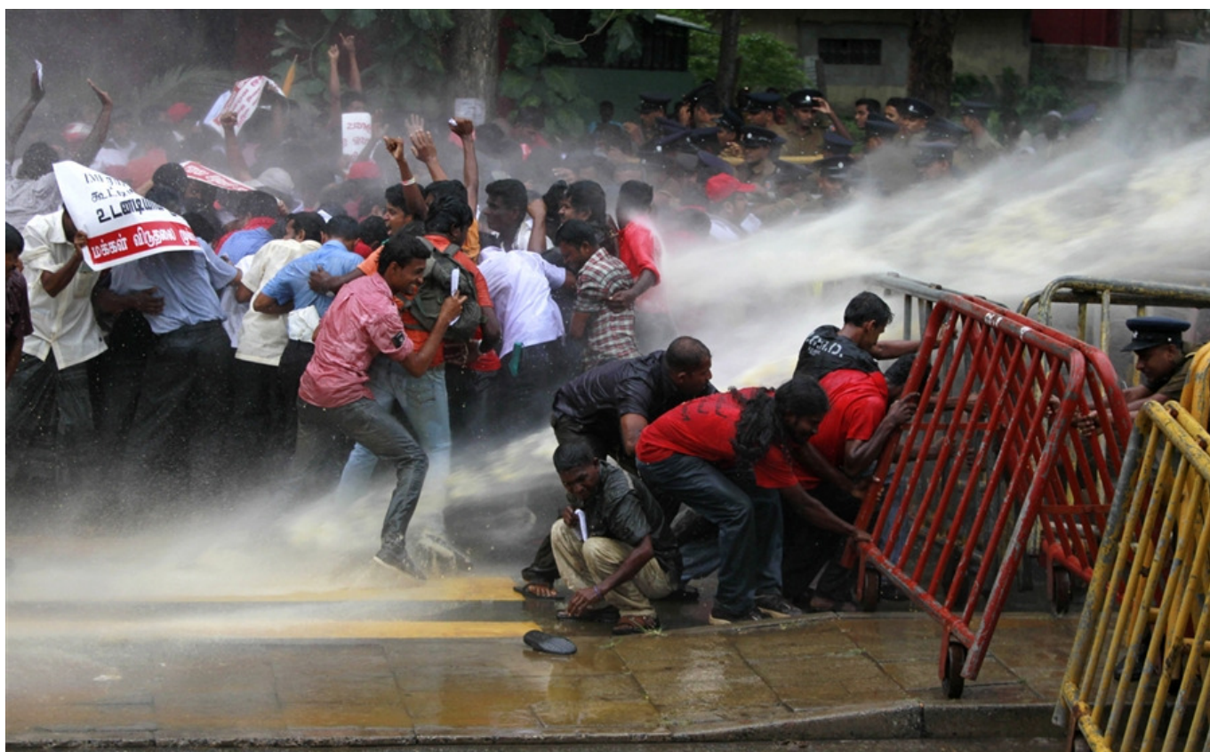
15 February Colombo, Police use water cannons against protesters

Issue No. 02 – 2 March 2012 19 th Session of the Human Rights Council, Geneva