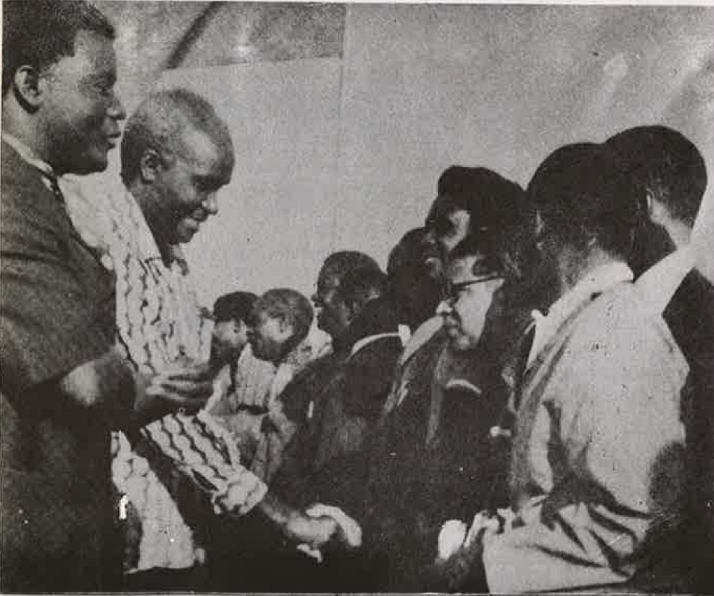
Afro-Asian Solidarity—The Author and other Heads of Government Departments welcoming President Kaunda on his visit to KASAMA the capital of the Northern Province in ZAMBIA

According to him, two youths were killed after having been inhumanly tortured and their bodies flung on the public highway. 147 youths have been taken into custody since the Emergency in July and a large number of them has since disappeared.