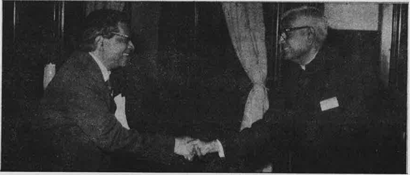
The President of India (then Finance Minister) receiving The Author in his New Delhi Office

Copy to: Hon. The Minister for Foreign Affairs NEW DELHI.