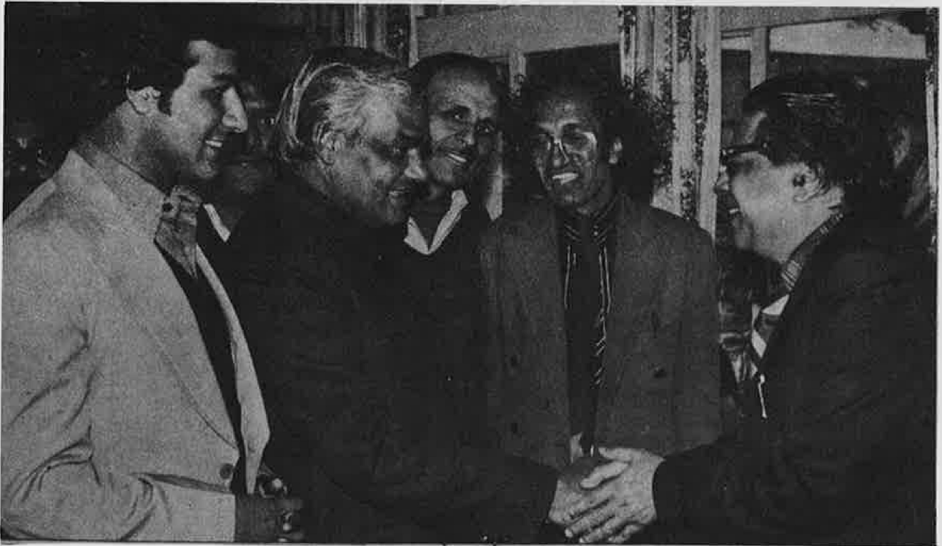
With the Hon. A.B. VAJPAYEE in New Delhi.