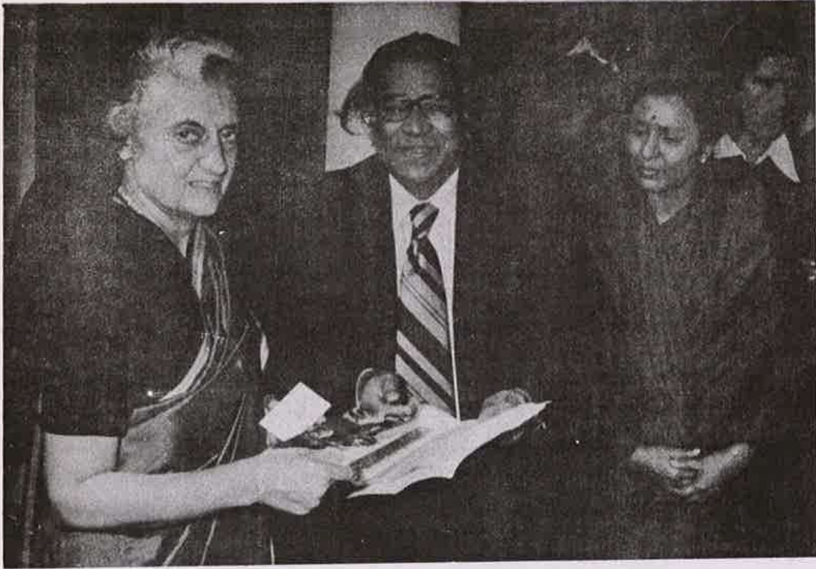
Meeting with Indian Prime Minister Mrs Indira Gandhi 28 January 1980