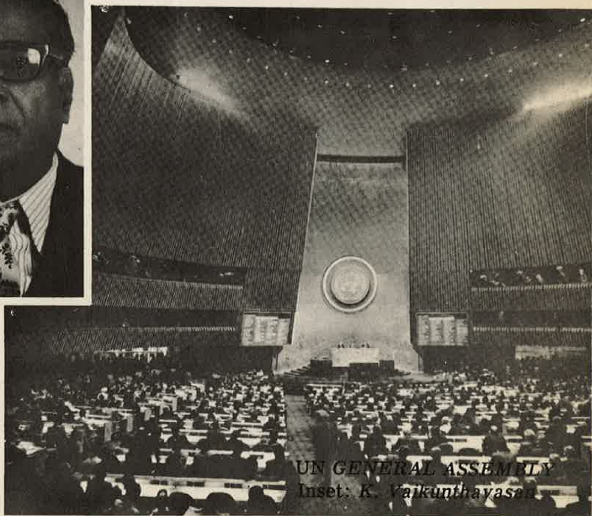
UN GENERAL ASSEMBLY Inset: K. Vaikunthavasan