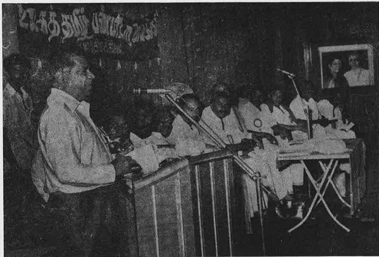
At the meeting held in Madurai, November 1980