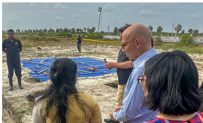
Visit of the High Commissioner for Human Rights, Volker Türk, to the Chemmani mass graves, 25 June 2025.

Its work has also contributed to broader OHCHR advocacy efforts in Sri Lanka, including in the context of the High Commissioner's visit in June 2025, which included extensive outreach to victims and a visit to the site of a mass grave and memorial site at Chemmani.